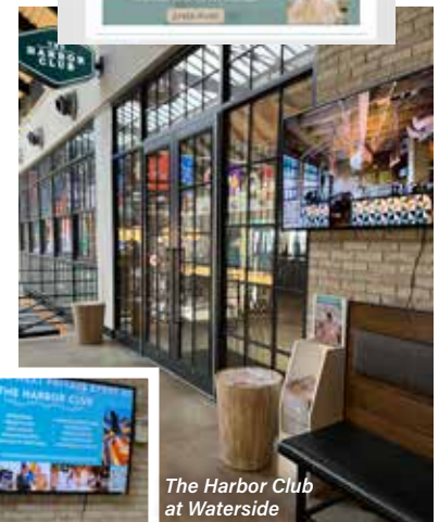
The Harbor Club at Waterside

Elizabeth Manor Country Club Hughes Florist Renaissance Hotel