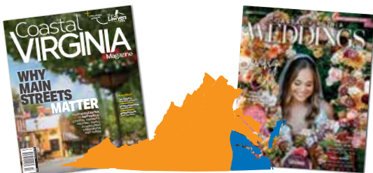
Map Of Region Highlighted In Blue