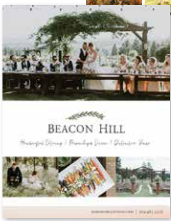
FULL PAGE SAMPLE

Ask The Expert (Added Value) This Q & A, 1/2 page format, positions each advertiser as an industry expert. Categories include hair and makeup, medical (Medi-Spa), fitness, caterers, event planners, florists, bakeries, jewelry, clothing, honeymoon, transportation and more. Available as added value with 1/2 page or larger ad purchase.